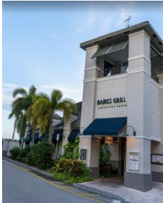
Baires Grill 2210 Weston Road Weston, Florida 33326

Be Kind Florida Inc. a non-profit organization dedicated to promoting cultural and social activities With a special focus on schools, senior living facilities, and cultural activities, among others.