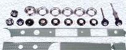
DASH & DASH COMPONENTS