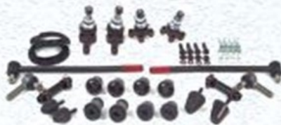
SUSPENSION & STEERING