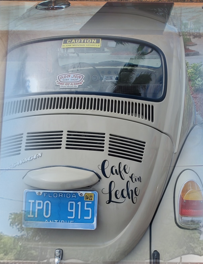
Publix Parking Lot on way to Tampa, Florida