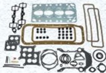
ENGINE & TRANSMISSION