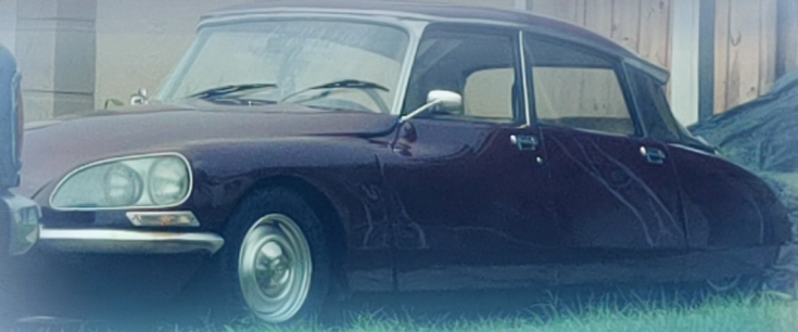
Residence in Fort Lauderdale, Florida