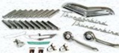
CHROME & EMBLEMS